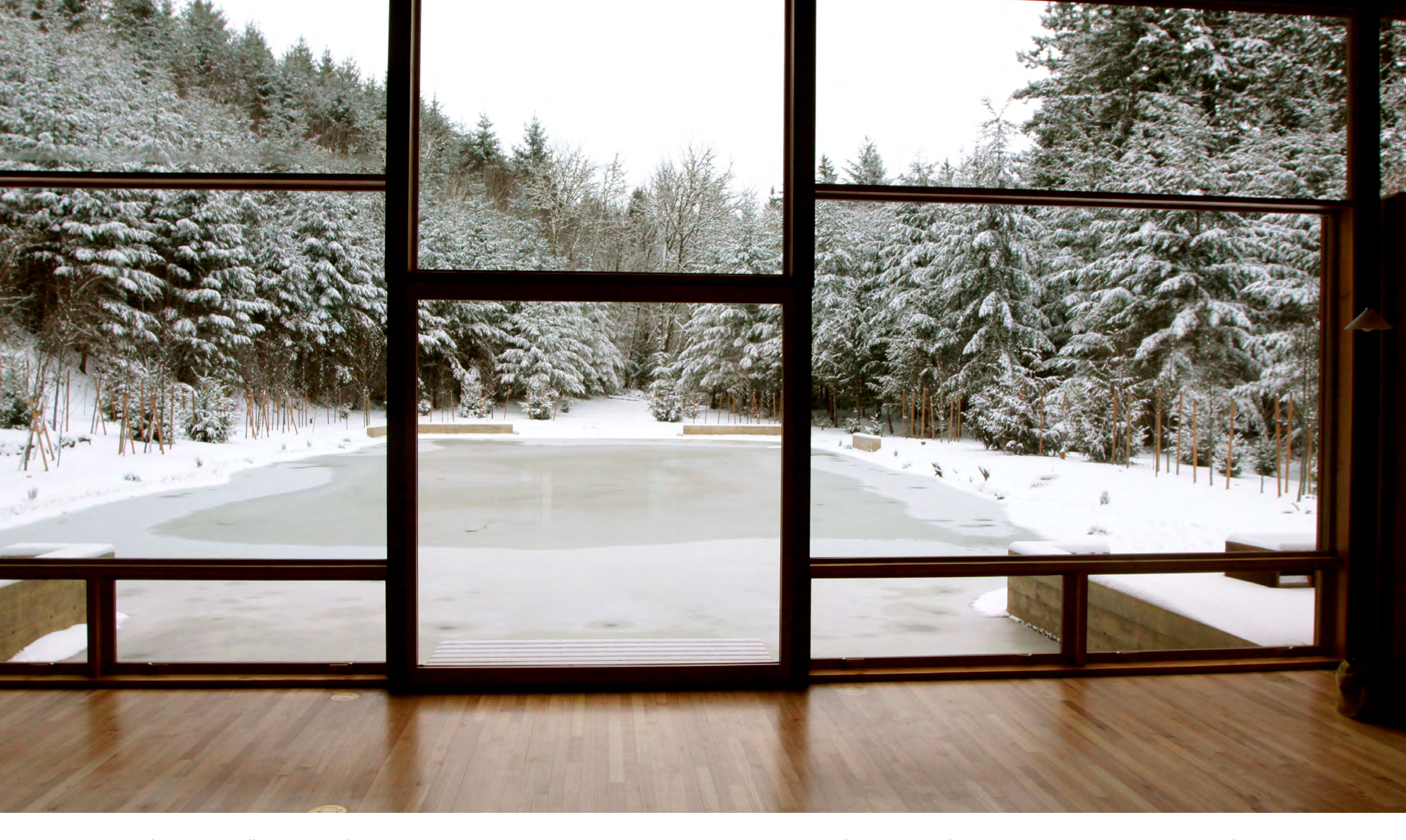
3 Passage of Time: The diffuse quality of light in the overcast winter, nurtures a contemplative landscape. The frosty retreat of the pond's emergent edge reveals a refined margin restrained order.