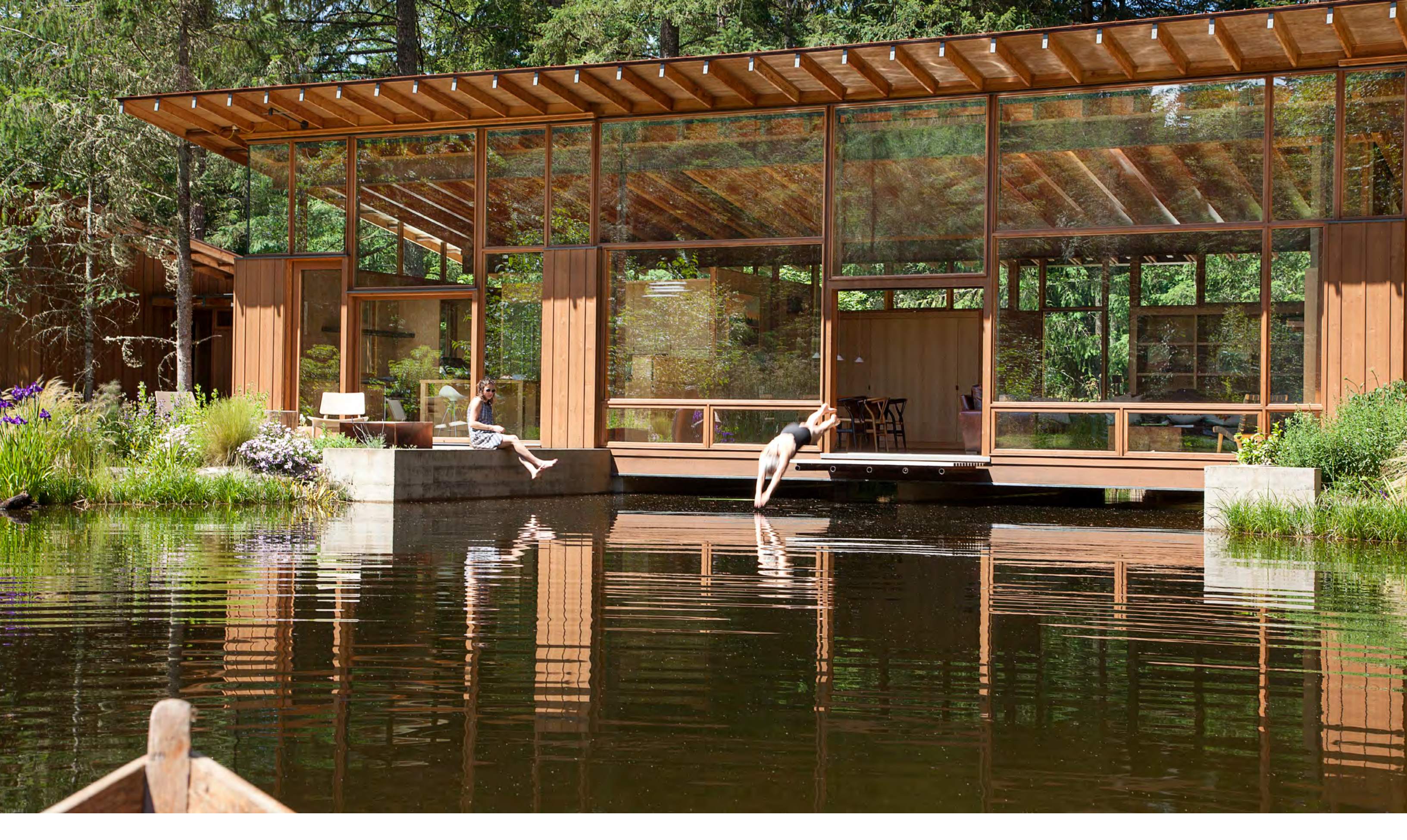
7 Living in Nature: A literal bridge, the home is both rooted to the land and free from it. The effortless connection between inside and out is at the water's edge and the landscape that flows up to meet them.