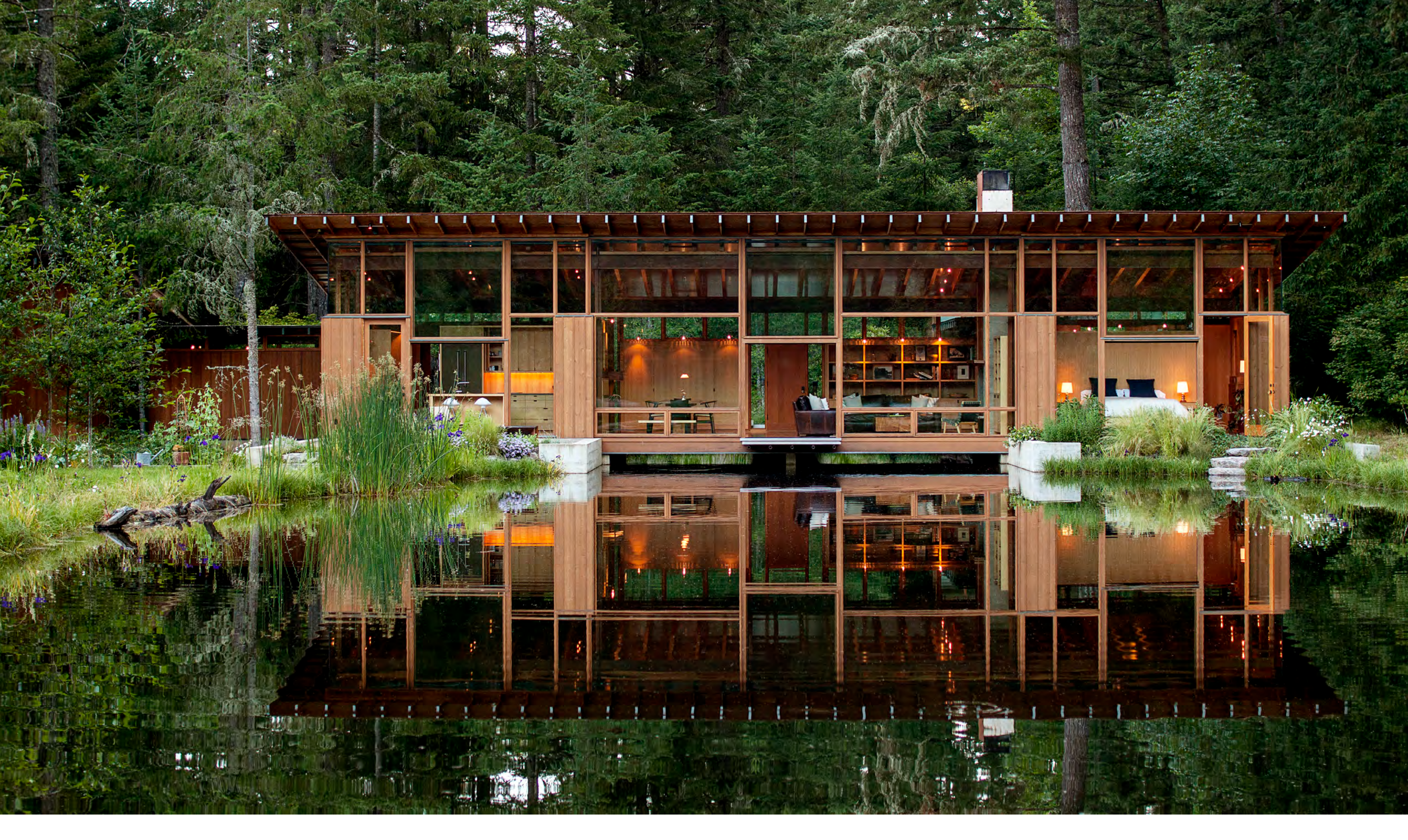
Refuge: At the juncture between forest and water, set at the vital edge of two environments, the home becomes the transition between the pond's horizontal plane and the verticality of the forest beyond.