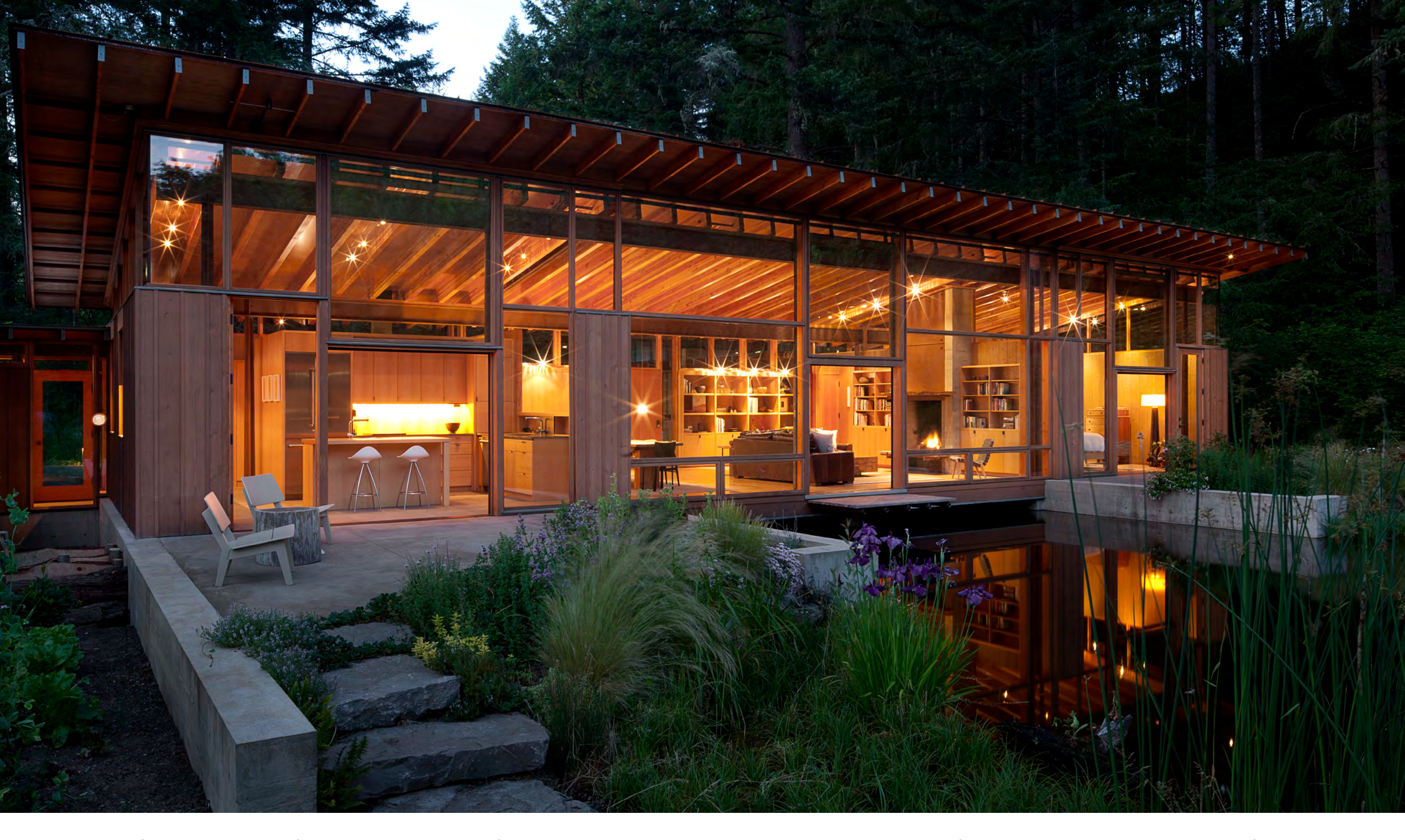
Repose: Simple site walls backfilled with plantings create informal patios eroding into the pond's edge. These intimate south facing spaces provide a warm, grounded feeling allowing the owners an active connection to their site.